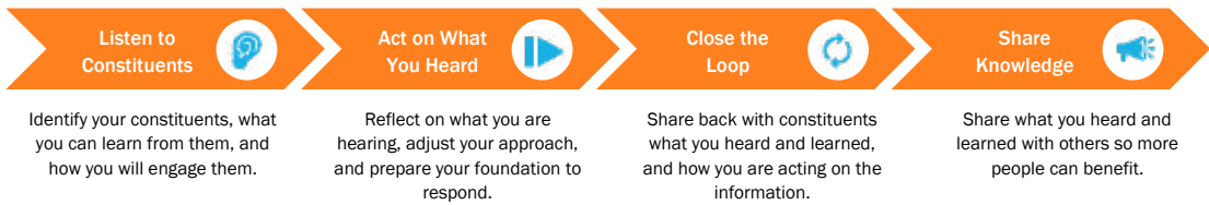
FIGURE 4 The Feedback Continuum