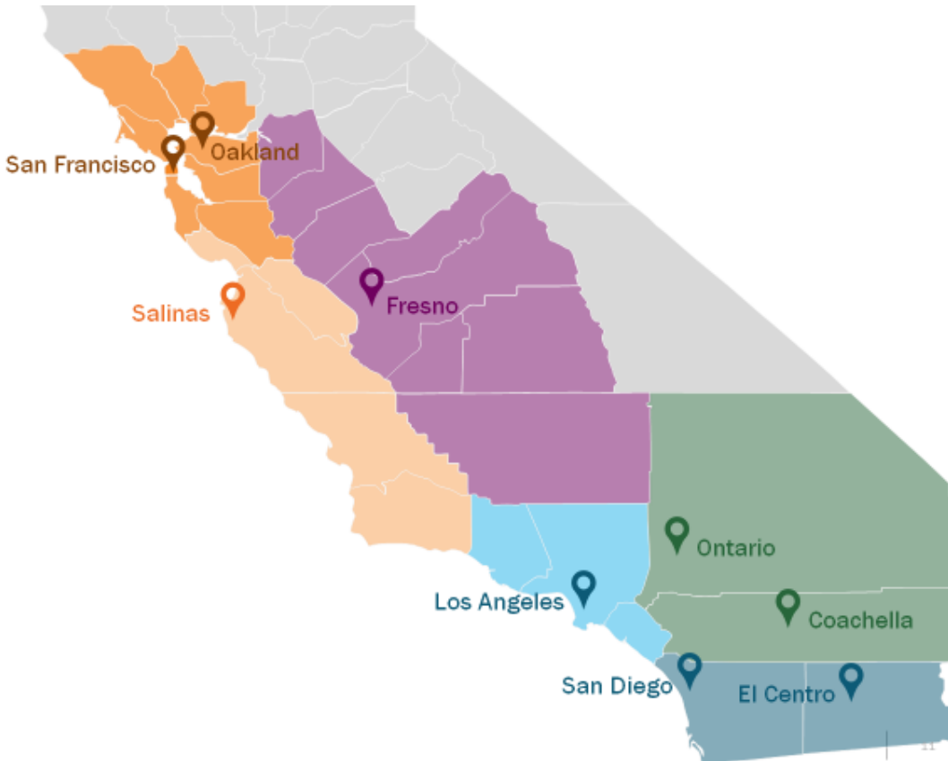
FIGURE 2 14 Community Listening Sessions in Six California Regions

they identified during the sessions. This was particularly important for participants who were experiencing a financial or family crisis.